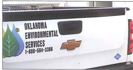
Oklahoma City-based consulting firm Oklahoma Environmental Services recently converted its truck fleet to CNG.